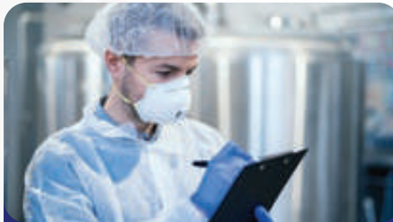
QA / QC staff