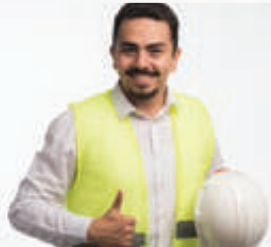
HSE officer/ Engineer

Arbrit tech is our contract staffing partner which offers a full array of staffing services, each carefully designed to address any hiring scenario you may face. Our core service offerings include contract staffing and permanent placement services for short term and long term basis.