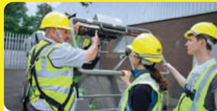
IPAF MOBILE VERTICAL (3A, 3A+) Scissor lifts, Vertical personnel platforms (mobile)

Arbrit Safety Training and Consultancy L.L.C is most recognized for providing IPAF training to professionals over the years. The IPAF training program is specifically designed for platform operators and has been developed by leading industry professionals. Below mentioned are some of the key courses available under this certified training program to enhance your career opportunities. Reach out to us to learn more about course details and other training programs.