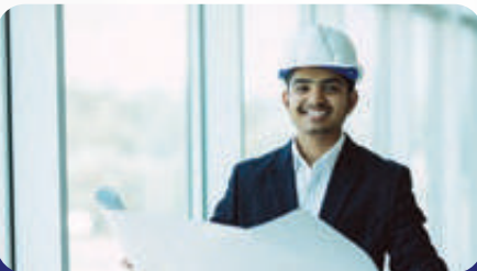
Technical/ Engineering staff