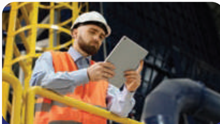
Appointed Person / Crane Supervisor for Lifting Operation