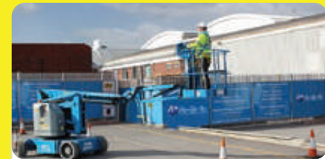
MOBILE BOOM (3B, 3B+) Self-propelled booms